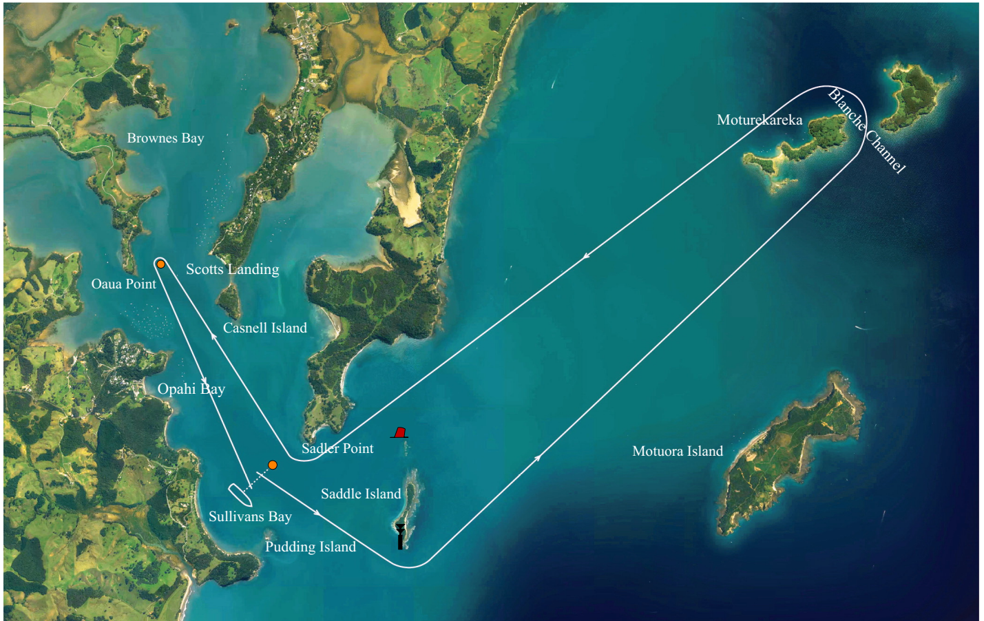
DIAGRAM ONLY. NOT TO BE USED FOR NAVIGATION. PLEASE CONSULT AN OFFICIAL CHART